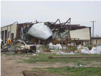
Above: aerial view - Mid-Plains warehouse is in the bottom right of the photo. Below: photos of the Mid-Plains warehouse.

The great news is that our friends at Mid-Plains are all safe and sound and in Tulia, no serious injuries were reported.